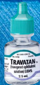
TRAVATAN® - по-мощен от Latanoprost на 24-я час след накарването 1 .